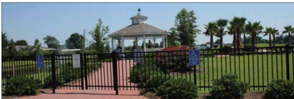
Pioneer park in historic downtown Summerdale

The library is open Monday through Friday 9 a.m. to 6 p.m., and on Saturdays from 9 a.m. to 1 p.m.